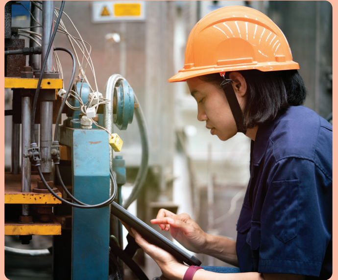
Automotive engineers make cars safer for people and the planet.