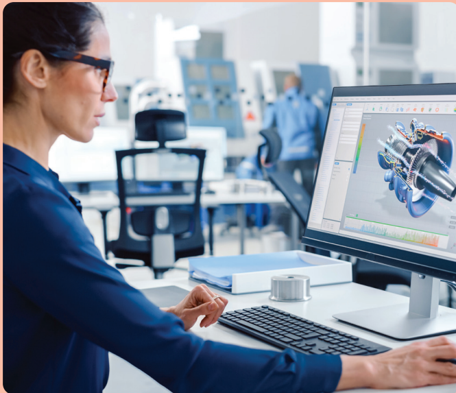
Digital sculptors create computer models of game characters, cars, and other objects.