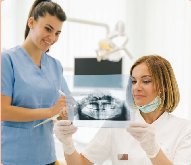
Dental hygienists help keep teeth clean and healthy.