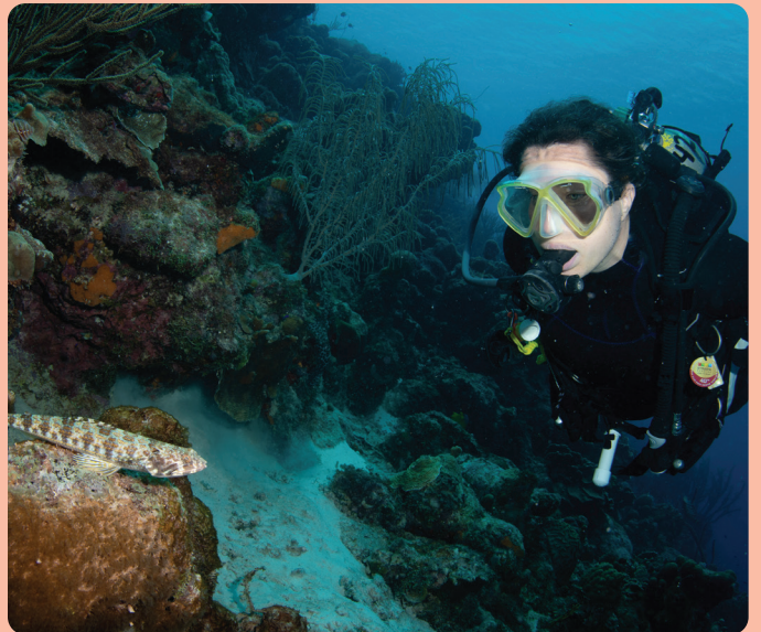
Marine biologists help animals that live in water, like fish and dolphins.